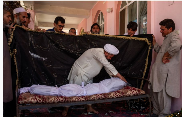
Burial for one of the 63 people killed in an Aug. 18 suicide bombing at a wedding in Kabul, Afghanistan.