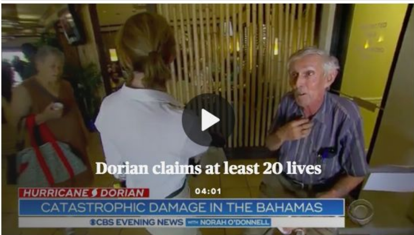
Dorian claims at least 20 lives

f Share / Tweet / Reddit / Flipboard / Email